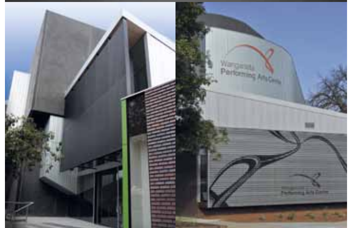
Wangaratta, Performing Arts Centre