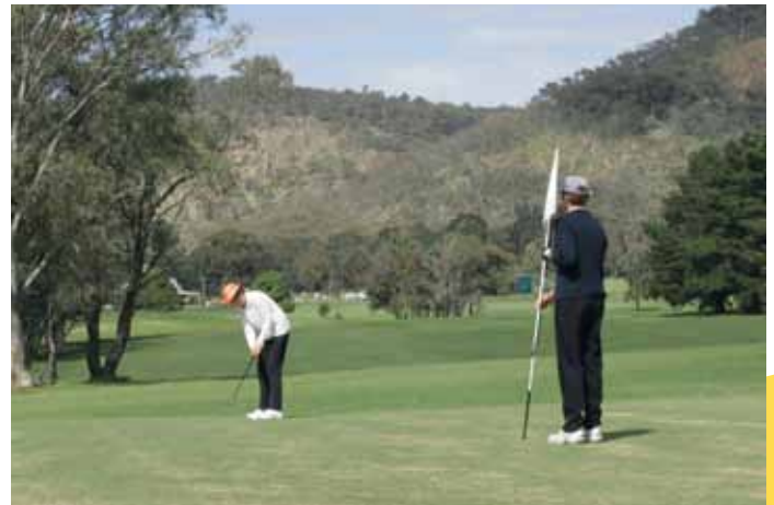
Jubilee Golf Club

Registration is open to individuals or teams. Green fees are $25 per person and tee off is at 12:30pm.