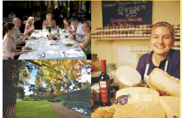
Enjoying food & wine

Day two will take you on a cultural and historical tour of the region including a visit to the Benalla Art Gallery, a tour of Glenrowan and Historical Ned Kelly sites, lunch at the Vine Hotel (own price) and return via Eldorado to view historical gold dredge.