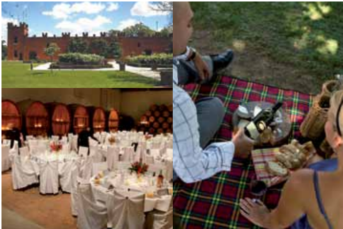
All Saints Winery

All events include bus transfers to and from the event to ensure you can fully enjoy the quality local wines.